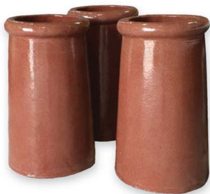
Salt (Gloss Glaze)