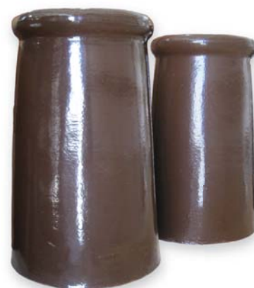
Brown (Gloss Glaze)