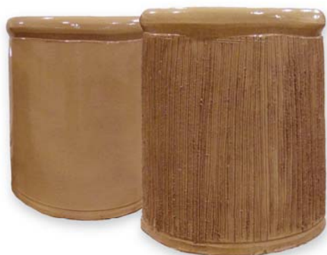
Tan (Gloss Glaze)