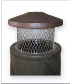
Rain Guard with Stainless Steel Base