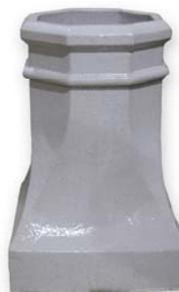
Gray (Gloss Glaze)