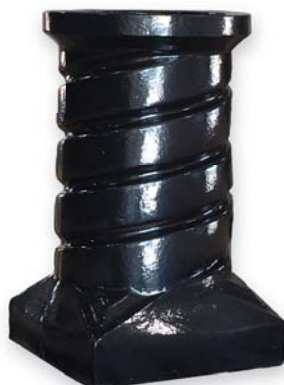
Black (Gloss Glaze)